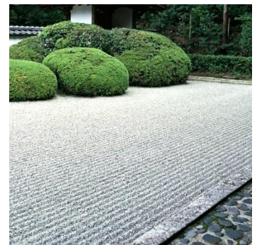
Examples of patterns you can create.